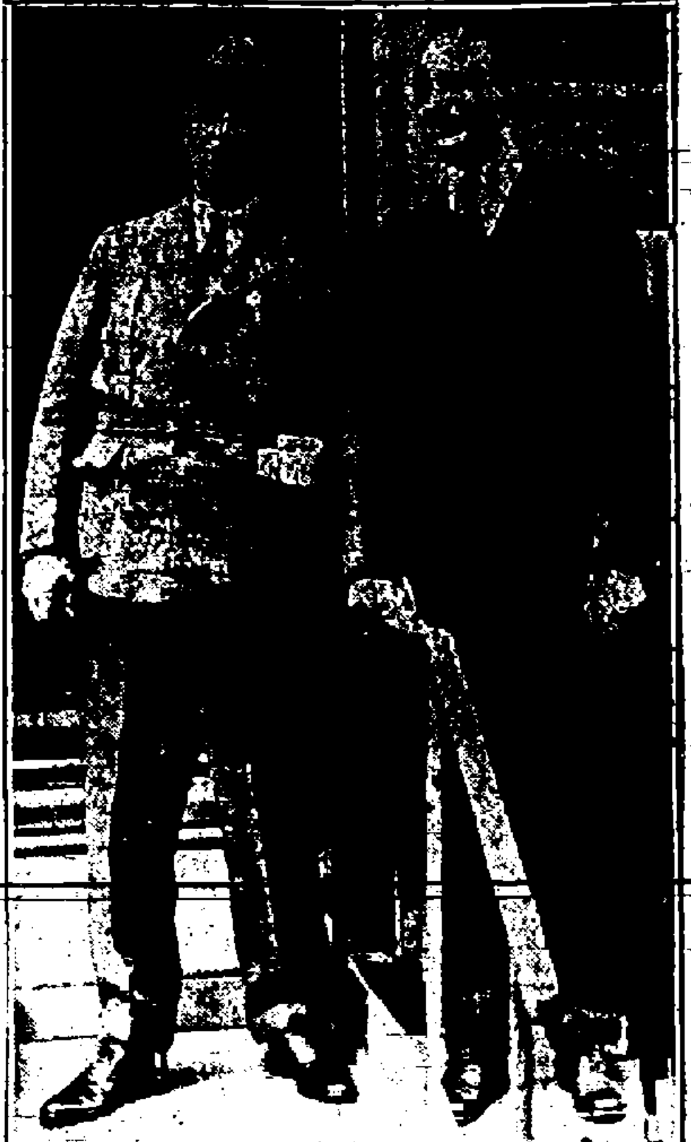
Preliminaries out of the way, President-elect Roosevelt goes to his Hyde Park estate to rest prior to assuming office as the nation's executive. He is shown, left, on the steps of his New York residence.

Los Angeles—The modern method of protecting orange and lemon groves from frost damage by orchard firing on cold nights is not so new after all, archaeologists point out.