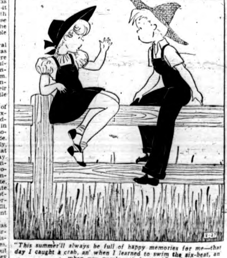
"This summer'll always be full of happy memories for me—that day I caught a crab, an' when I learned to swim the six-foot, an' when you nearly got drowned."