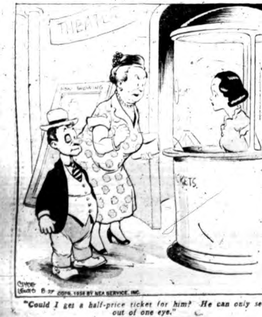
"Could I get a half-price ticket for him? He can only see out of one eye."