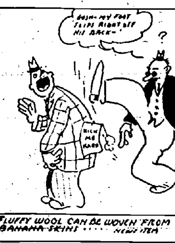
FLUFFY WOOL CAN BE WOVEN FROM BANANA SKIN - NEWS ITEM