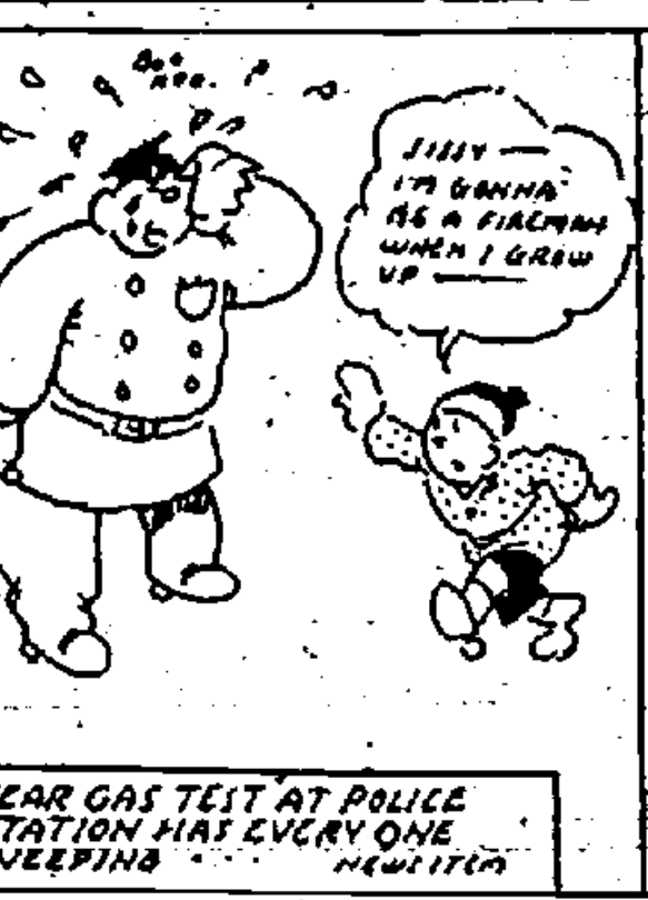
TEAR GAS TEST AT POLICE STATION HAS EVERY ONE WEEPING - NEWS ITEM