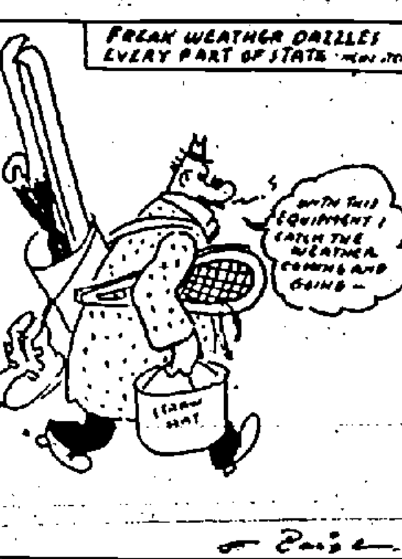
BREAK WEATHER DAILIES EVERY PART OF STATE - NEWS ITEM